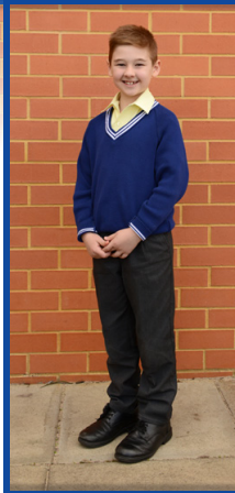
Winter Uniform Boys