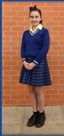
Winter Uniform Girls