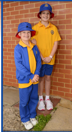
Sport Uniforms Unisex

Acceptable footwear black enclosed shoes or blue sandals with summer uniform.