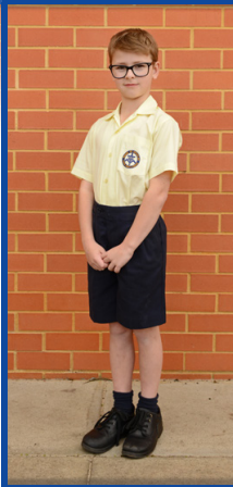
Summer Uniform Boys