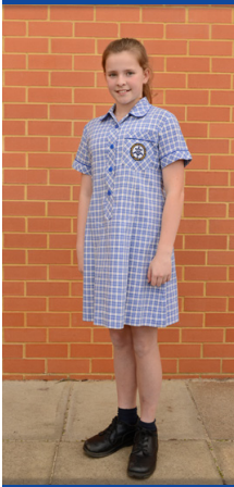
Summer Uniform Girls