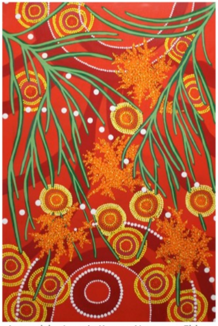
Artwork by Janetia Knapp, Nyoongar Elder

Let's begin with an Acknowledgement of Country